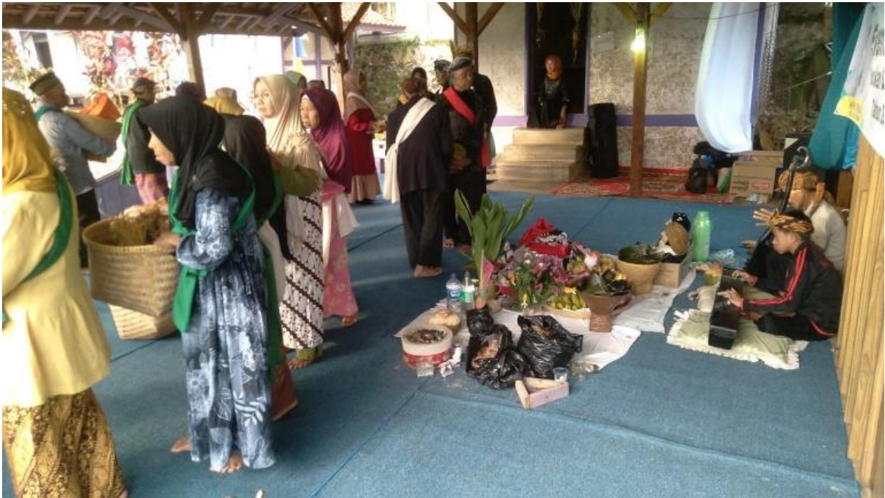
Figure 2. Ngalaksa Traditional Ceremony