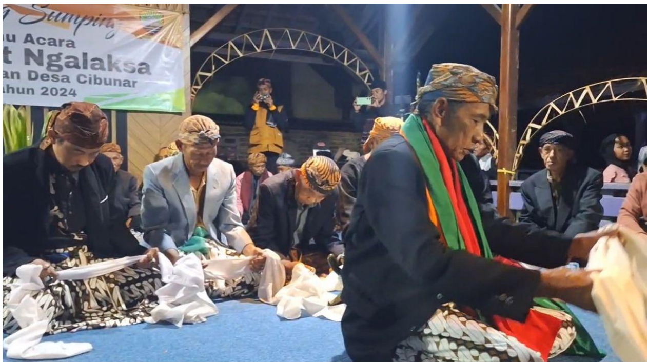
Figure 3. Tarawangsa in Ngalaksa Traditional Ceremony

Participation in the Ngalaksa traditional ceremony is open to both local community members and outsiders (Kartika et al., 2024). Additionally, individuals and communities can contribute by donating food or drinks to support the ritual. This tradition helps maintain the customs of the Rancakalong community as an expression of gratitude to the Almighty for the harvest. The implementation of this tradition also preserves the customs inherited from previous generations. Furthermore, the Ngalaksa traditional ceremony embodies noble values that are essential for strengthening a country’s identity and character. The Ngalaksa traditional ceremony is often accompanied by tarawangsa and jentreng music (Yulaeliah, 2012).