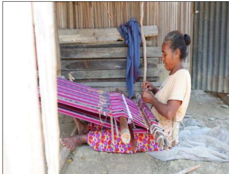
Figure 1. Portrait of East Timorese ex-refugee in Fatuba's Village